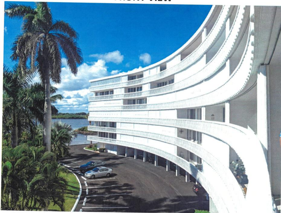
BALCONY SIDE VIEW