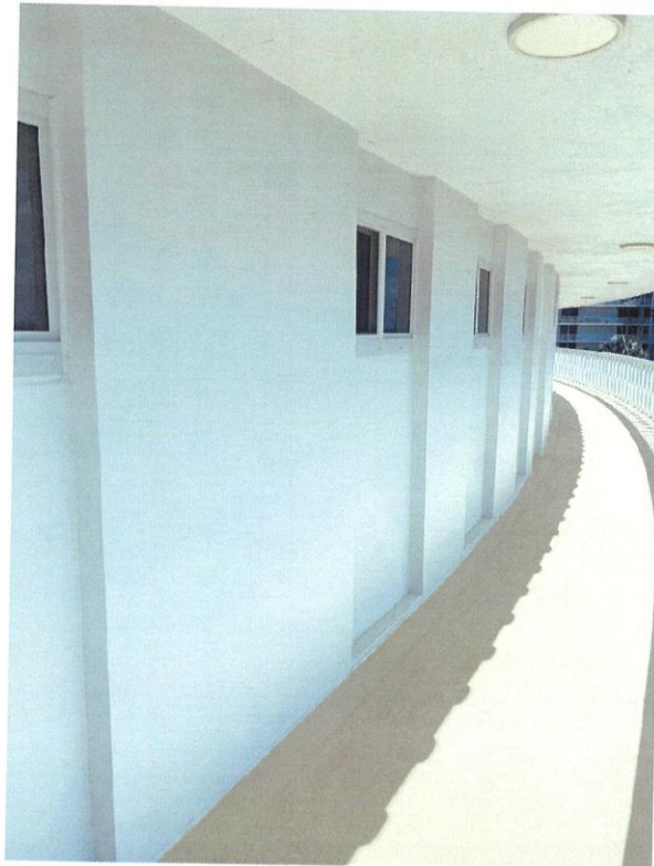
FRONT WALKWAY - TYPICAL